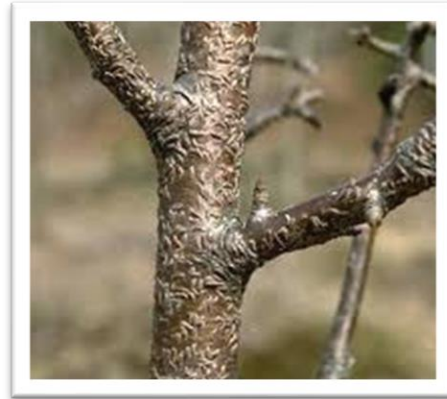
Oyster Shell Scale