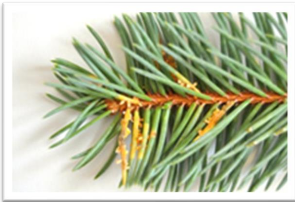
Rust on Spruce