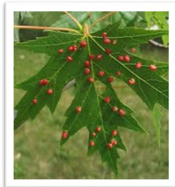
Gall Mite on Maple